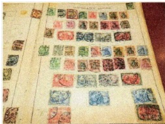
An old, "stuckdown era" page

Philately, in its primitive stage, was somewhat uncouth. People acquired a few stamps, and soon thereafter, an album. Crests were fashionably collected in those days and they were just stuck flat to albums, so what more natural than that stamps be handled in -the same way? You can find an article in the American Journal of Philately (April, 1868), wherein instructions were given on how, properly, to mount specimens, and it read in part, "a strong solution of gum-arabic will meet every practical purpose and it may be applied with a medium-sized paint brush." You were to smear a streak of the gum-arabic across the top of the stamp, and again across the bottom, and this would be. "sufficient to affix the rarest stamp, and will admit of an easy removal, when required." Stamps did, of course, come off with thin spots, frequently, upon removal, if they did not rip in the midriff at the first yank.