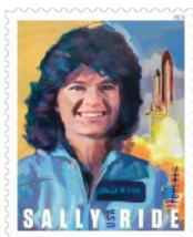
May 23 Sally Ride