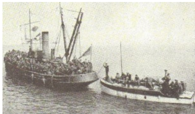
Figure 1. Just an example of the types of boats used in Operation Dynamo, here a tug pulls a small pleasure craft the 22 miles to the English shore.

Britain mounts an operation called "Operation Dynamo", where she mobilizes 850 ships and boats (mainly boats) to evacuate her troops from the coast of France. In case you don't know the difference between a ship and a boat, the classical definition is "you can carry a boat on a ship". Amazingly by June 4 this operation is complete and 338,000 troops were evacuated, many of them open longboats towed behind ships.