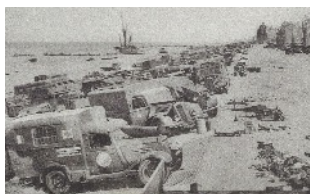
Figure 3. Just a sampling of Britain's cars, trucks, and armored vehicles left on the beaches of Dunkirk.

Most importantly Britain had left 70% of her Army Infantry Officer Corps in the hands of the Germans! It's a recognized fact that had Hitler decided to invade at that time the only thing Britain had to defend herself was an unarmed army and an armed Home Guard generally carrying personal shot guns.