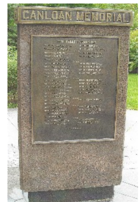
Figure 6. The CANLOAN Memorial in Ottawa.

Of the 622 officers who joined British forces 43 were killed in action, the group acquitted themselves extremely well suffering many casualties and earning decorations disproportionately to their numbers. On a recent visit to Ottawa I went to see the CANLOAN memorial to her 43 Killed In Action members, located on a quiet street in the diplomatic area of Ottawa.