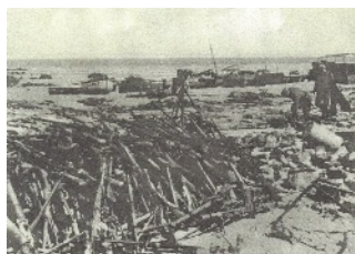
Figure 2. Small arms piled on the beach of Dunkirk by the Germans

When all that could be evacuated were, Great Britain had left 75 % of all her supply of small arms, cars, trucks, (see figures 2 and 3)