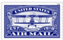
May 1 U.S. Airmail (Blue)