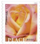
April 21 Peace Rose