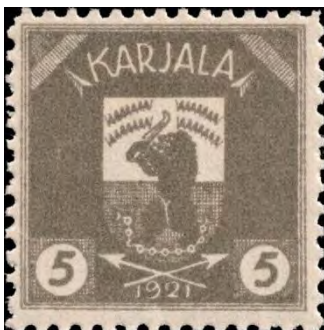
Genuine Scott #1