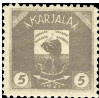
Fake Scott #1

In 1922 Karelia issued a set of 15 stamps in different denominations. The stamps picture a raging bear swinging a hooked blade called a vesuri against a backdrop of northern lights and standing on the broken shackles of Russian oppression. The stamps were only valid between Jan 31 and Feb 15, 1922 and examples of genuinely used stamps are rare and valuable.