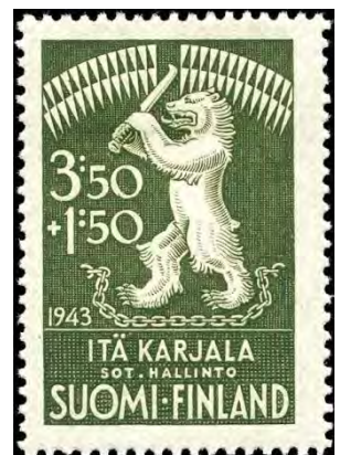
1943 Karelia Semi-Postal

Under Finnish occupation Karelia again issued stamps between 1941 and 1943. In 1943 the Soviet Union regained control of Eastern Karelia and Karelia has been a federated state within the Soviet Union and current Russian Federation ever since