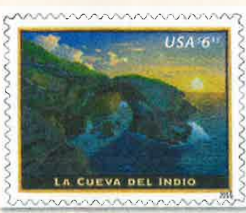
43. La Cueva del Indio stamped envelope