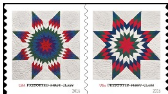
July 6 - Star Quilts