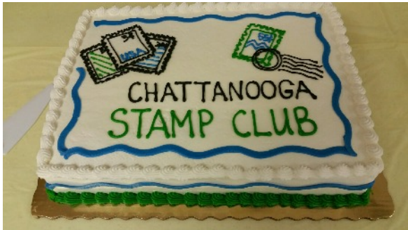
The cake that was served as the refreshment at the March 9 meeting.