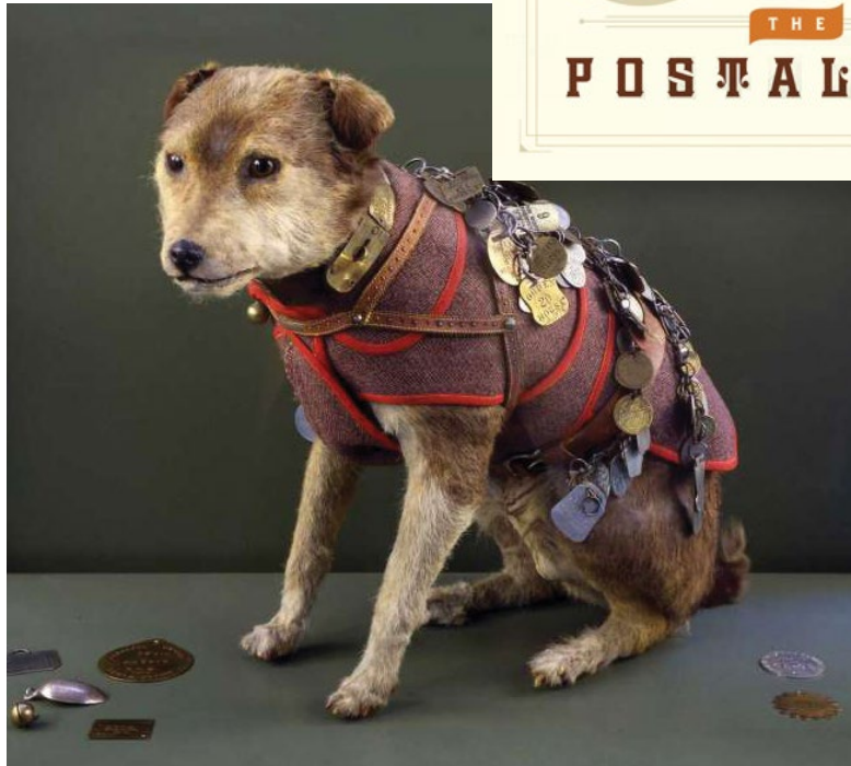
Owney's body was collected and is now preserved, along with his harness and the medals, in the Smithsonian Postal Museum in Washington, DC. All dog lovers should see it.