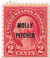
US #646, the Molly Pitcher overprint — not a surcharge.

The basic denomination of Hungarian currency in 1945 was the pengo. If one was to buy an item in Budapest in April 1945 for 500 pengo (about $2) by January that item