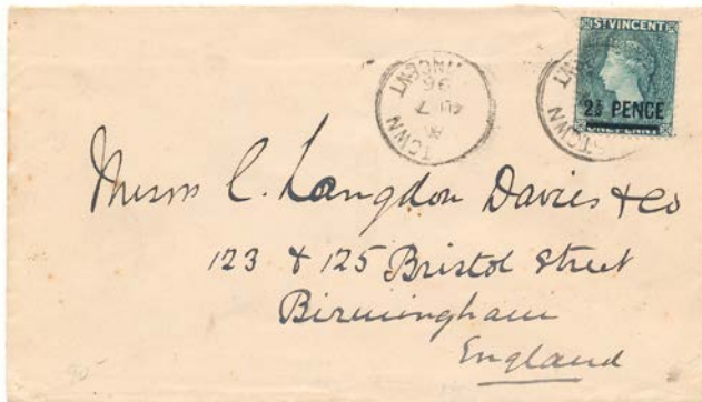
Postmarked Kingstown, St. Vincent and addressed to Birmingham, England, this cover uses the surcharged stamp #56 for the postage following the entry of St. Vincent to the UPU.

of the Windward Islands went into effect. Having no 1/2d stamps, the local postal administration took 12 sheets of 60 of the 6d yellow green (Scott #28), surcharged them with 1/2d using a local printer, with each stamp getting two surcharges, then reperfed to bisect them! This is Scott #31.