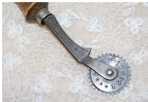
Figure 2 An example of a nineteenth century pounce or pattern wheel, similar to the type of device possibly used to create "sewing machine perfs" on the second issue US revenues.

I found my example in a "junk" US revenue lot on eBay in June 2017. It was tucked off to the right side of one of the two low resolution scans. I could not tell for sure if it truly was a sewing machine perf (Chameleon paper second issues can have very rough perforations), but sometimes it pays to take chances.