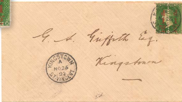
The unseparated pair of St. Vincent #31 used on a local cover in Kingstown.

The 6d yellow green used as the basis for the surcharging to 1/2d. The pair of #28 surcharged then bisected—note that the perforations for the bisect are cleaner than the peripheral perfs. Also note that the printer put the “pence” designation above the value indication, for space reasons.