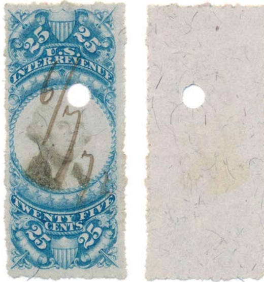
Figure 1 R112b, found in a 2-page "junk" lot of US revenues on eBay, June 2017. This is the "fuzzy" style "sewing machine perf".

In addition to the "sewing machine perfs", the R112 and the R115 can be found as even scarcer perforated 8. We do not know who was responsible for these "private perforation varieties", but we do know that many of them were used from June to September 1872 in New York and Philadelphia.