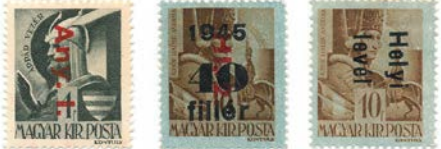
These three examples of the Hungarian Permit Stamps issued in 1946 are Scott #'s (l to r) 801, 805, & 806. Note that the Permit surcharge was sometimes printed over a previous surcharge.

Before changing the currency, Hungary tried another approach to the inflation crisis that is unique in philately. In January of 1946, they began issuing a series of stamps with overprints like "HL.1", "Helyi/level", "Ajl.1", "Ajanlas", and other similar types. These are so-called "permit" stamps. Each had a new value, but it was unstated in the overprint. These surcharges were valued so as to pay the entire postage for certain types of mail. "HL.1" and "Helyi/level" paid the postage for a local letter, while "Ajl.1" and "Ajanlas" paid a registration fee. The other abbreviations covered post cards, printed matter, parcels, etc. The intent was to enable the use of a single stamp on each item rather than a combination of stamps. For reasons unclear, the system did not work. Many more covers are found with combinations of stamps during the early days of 1946 than covers using a single permit stamp. If the Hungarian post office had only realized that by adjusting the selling price periodically, they would have created the first "Forever" stamp!