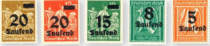
The first five in Germany's surcharge series of 1923

The German example is more illustrative of surcharging. Since Germany used it four times during their inflation period and more postal history is available than from Hungary. From 1918 through the end of 1923, Germany went through 23 rate changes. A good example of their surcharging is the overprinting of the numeral issues of 1922 and early 1923 with values 10 fold to 100-fold higher, resulting in the series identified in Scott as #'s 241 - 278, and issued 23 August 1923. These stamps were used through several rate changes and were only replaced in the last quarter of 1923 when new denominations were printed, only for them to be overprinted in December of 1923. In order to accommodate the demands, the surcharges were used on multiple different base denominations: the 2 million mark surcharge was used on 6 different stamps,