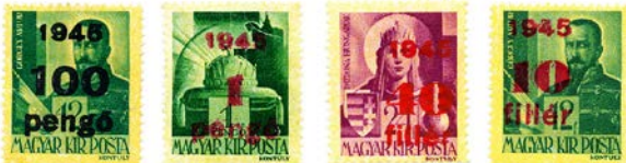
Four examples of the surcharges of mid-1945 on the definitives issued in 1943, with surcharges up to 100 pengos.

would have cost 1.6 Million pengos and by May 1946 it would have cost 85,000,000,000,000,000 pengos and in July of 1946 — 900,000,000,000,000,000,000,000,000,000,000 pengos! Rates changed 2x/day, often by a factor of 10. Money was less than worthless, and the very act of printing stamps cost more by the time the ink dried than the stamps were worth. Even overprinting was not cost effective, but was attempted - with only limited success. The definitives of 1944 were overprinted in 1945 with 100-fold surcharges, up to 100 pengo, but it still required many stamps to mail a letter: single franking is rarely seen.