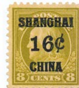
Examples of the two issues of stamps surcharged by the US for use in the China service. Top is #K8, and bottom, on a piece postmarked September 22 1922, China, is a pair of #K18.

The US also surcharged a number of postal stationery pieces, mostly in the 1920's. The reasons for the surcharging and the varieties are very broad, and deserve a separate discussion beyond the scope of this article.