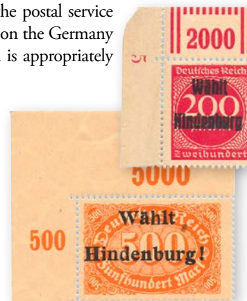
The inflation period stamp surplus was overprinted for political labels. This translates to: "Elect Hindenburg".

The proliferation of stamps for the inflation period led to a glut of unused stamps: the inexpensive unused inflation stamps are a testament to this. The excess stamps also lent themselves to other uses: in the accompanying figure is a sample of how the inflation excess was subsequently overprinted for political labels.