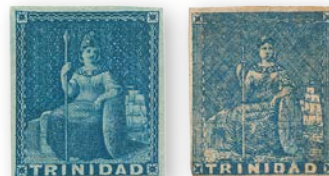
Trinidad #3, the (1d) blue printed by Perkins-Bacon in London is on the left. Trinidad #9, also a (1d) blue but printed in Trinidad, is on the right. Notice the lack of clarity in the Trinidad printing. #3 is also printed on blue paper; #9 on white paper.

For surcharging examples, we will turn to Trinidad, because of the peculiar circumstances prevailing in Trinidad in the 1800's. Firstly, that colony was one of the very few of the British Caribbean colonies that printed some of their own early stamps. A used Britannia die was obtained and local shops printed 6 issues between 1852 & 1859 (Scott #'s 7,9,10,11,12 & 13). These