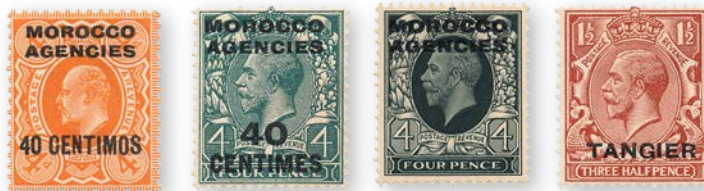
The four types of overprints of British stamps for use in Morocco, left to right: value in centimos for use in the Spanish zone (#40); value in centimes for the French zone in Southern Morocco (#406); value of base stamp for use at British post offices throughout Morocco (#240); and value of base stamp for use at British post offices in Tangier (#507).