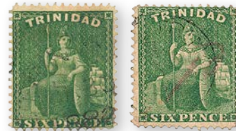
A used copy of Trinidad #60, the base stamp for the manuscript surcharging in 1882.

In April of 1882, Trinidad received its last shipment - a small one - of the 1/2d and 1d Britannia stamps, and the new Queen Victoria issue wasn't due to arrive until January 1883. Simultaneously, the rate for inter-island mail dropped from 6d to 2 1/2d, leaving a large surplus of the 6d green Britannia (Scott #60). Expecting to run out of 1d stamps, since they paid the rate for intra-island and local mail, the postal officials decided to have the postal clerks surcharge the 6d stamps by hand , not even with a rubber stamp! They were to write, in red ink, a "1d" over the face of the stamp and line out, in red, the "six pence" at the