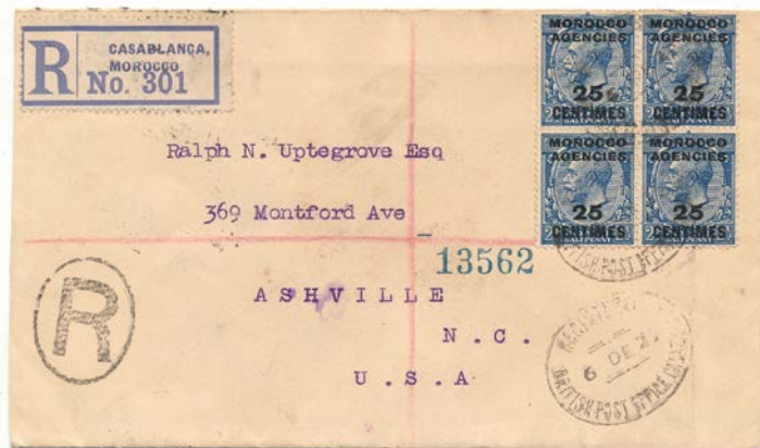
This piece of registered mail originated in Casablanca, French section of Morocco. It is postmarked 6 December 1922 at the British Post Office in Casablanca and was sent to Ashville (sic), NC and franked with a block of four #405.