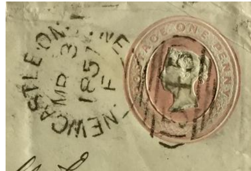
Figure 5. Penny Pink embossed postal stationery (magnified size): Sideways duplex 545 oval shaped postmark*.