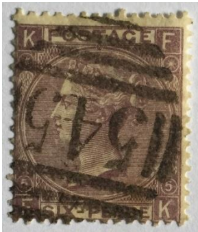
Figure 3. 6d deep lilac (plate 5) issued March 7 th 1865 (magnified size): 545 code. 7

The images below show examples of Newcastle-on-Tyne 545 usage.