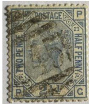
Figure 4. 2 ½ d Blue (plate 23) issued March 23 rd 1881 (magnified size): 545 code. 7