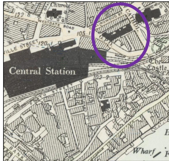
Figure 2: Map of Newcastle-upon-Tyne (circa: 1888).

The status of city was granted to Newcastle-upon Tyne on 3 June 1882. 6