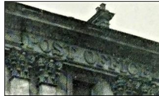
Figure 7 (above): Close-up of “ POST OFFICE ” stone façade on building.

The Post Office building is located on St. Nicholas’ Street in Newcastle (opposite the city cathedral).