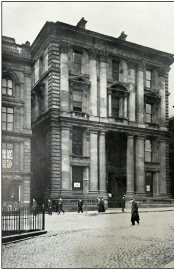
Figure 6 (above): photo of Post Office building (circa: 1900 ).

The landmark post office in Victorian Newcastle was built between 1871 and 1874 by James Williams (1824 – 1892). He was appointed surveyor for the building of post offices in 1859. The building still stands today. 8 A photograph is shown below.