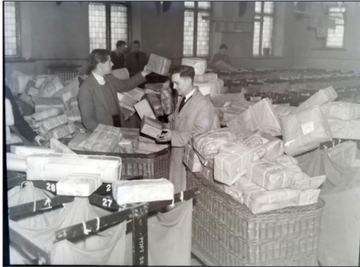
Figure 6. Photo (circa 1954): The West Hartlepool Post Office temporarily took over premises at a local church hall in the 1950s to cope with the massive number of CHRISTMAS POST parcels. Students were usually employed to cope with demand.