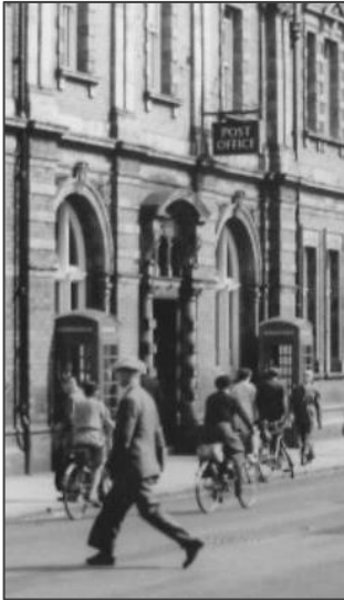
Figure 5. Photo (circa 1955) showing main entrance with POST OFFICE sign above door.

Figure 5 not only shows the POST OFFICE sign above the main door, but also two (2) public telephone boxes, one (1) either side of the door.