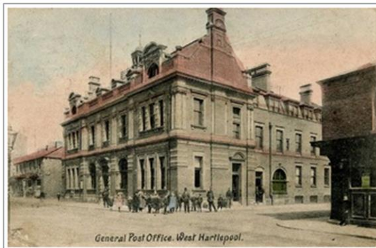
Figure 3: Archival postcard.

The street address is 13 – 17 Whitby Street .