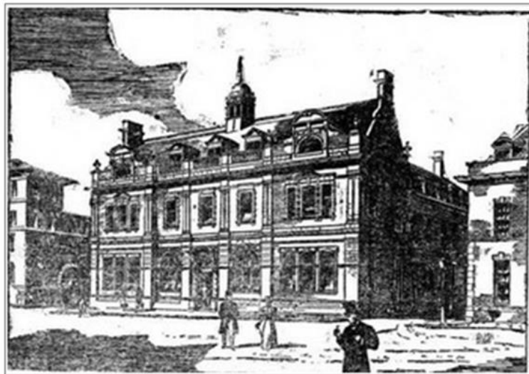
Figure 4: Newspaper sketch.

The sketch opposite ( Figure 4 ) shows the building as it was published in the Northern Daily Mail newspaper (20 th July 1898).