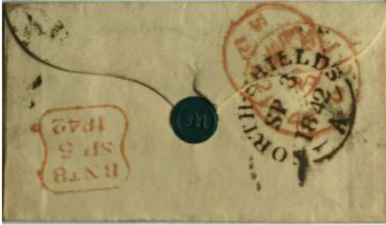
Figure 3. Obverse of cover. Posted from NORTH SHIELDS SP 3 1842 . Addressed to London address on front (not shown).