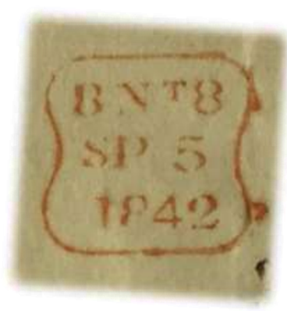
Figure 4. Date and Hour Stamp. Receiving London office: 8 N T 8 SP 5 1842 (red) . The time is 8 PM at night , indicated by " 8 N T 8 ".

As another example, with a different day period abbreviation, " 1 A N 1 " denoted one o'clock in the afternoon . 7