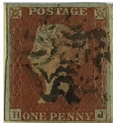
Figure 5. Imperforate 1d. red-brown with BLACK Maltese