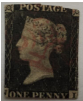
Figure 3. Penny Black with RED Maltese Cross

Simultaneously, when the color of the ONE PENNY postage stamp was changed from black to red in 1841, the main fraud problem was solved by its combination with the black ink cancellation usage. All Postmasters were notified of the combined change in 1841 using a Postal Notice (with specimens), which stated that: “It is intended, hereafter, to obliterate the Postage Stamps with Black Composition, a supply of which will be forwarded to you as soon as possible, but until you receive this supply you will continue to obliterate the Postage Stamp with the Red Composition, as heretofore. By command. E. S. LEES.” 4 Examples are shown below: