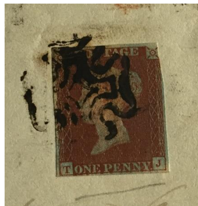
Figure 4. Imperforate 1d. red-brown with BLACK Maltese