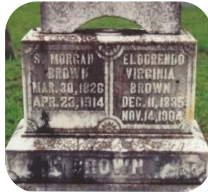
Figure 4. Headstones for Shadrick and Eldorendo Brown.