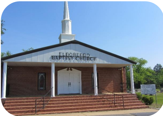
Figure 3. Eldorendo Baptist Church.