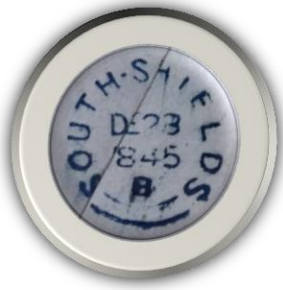
Figure 2. Obverse: backstamp (Circular dated double arc*). Received: SOUTH SHIELDS DE 28 1845.