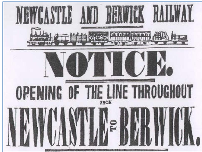
Figure 7. NOTICE announcing the opening of the Newcastle to Berwick railway line.

Newcastle-on-Tyne is located in Northumberland (North East of England).