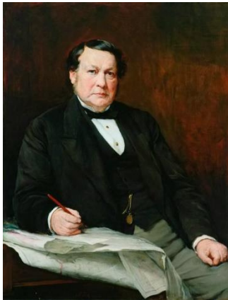
Figure 5. Portrait commissioned for the board room of the North Eastern Railway (circa 1884).

†Similarly, handstamps, usually in black, used to show that post was due (from recipient), for items not pre-paid.