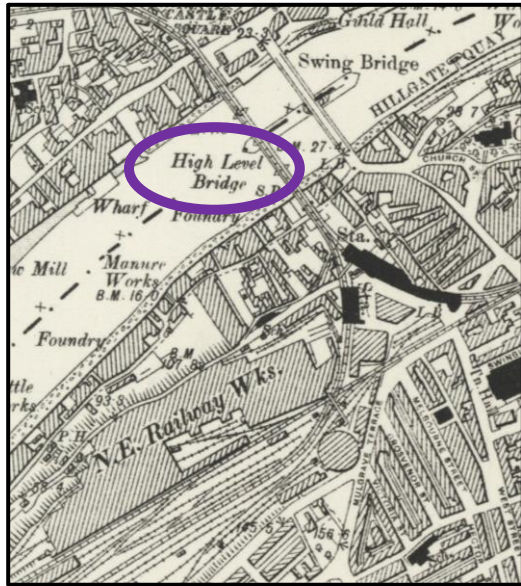
Figure 6. Map of Newcastle-on-Tyne (circa: 1888) showing High Level Bridge over River Tyne (circled in blue). North Eastern Railway Works (N. E. Railway Wks.) are also shown on this map.