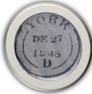
Figure 3. Circular dated double arc*. Mailed: YORK DE 27 1845.