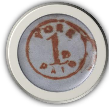
Figure 4. YORK 1d PAID. Used to show postage had been pre-paid†. System continued in diminishing use until the 1850s.

*Circular dated double arc postmarks were used from 1829 and were normally associated with provincial head offices of Great Britain and Ireland.