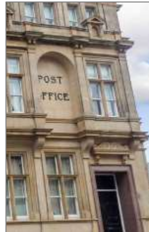
Figure 4: Contemporary photo of Post Office façade.

When functioning as the post office, the public lobby in the building had teak-lined walls and was 40 feet (ft) by 25ft in size. Behind the public lobby was the mail sorting room (125ft long by 52ft wide) which was partially lit by glass roofing. The second floor housed the Postmaster's private office and the telegraph engineer's office. 5