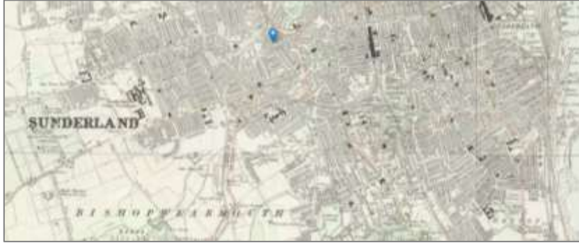
Figure 2: Map of Sunderland (circa: 1888). 4

This post office case study is of Sunderland , which has the associated numeric allocation of 761 . 2,3 Sunderland is located on the coastline of the North East of England, on the River Wear. Sunderland was an industrial port complex with a multitude of railway connections.