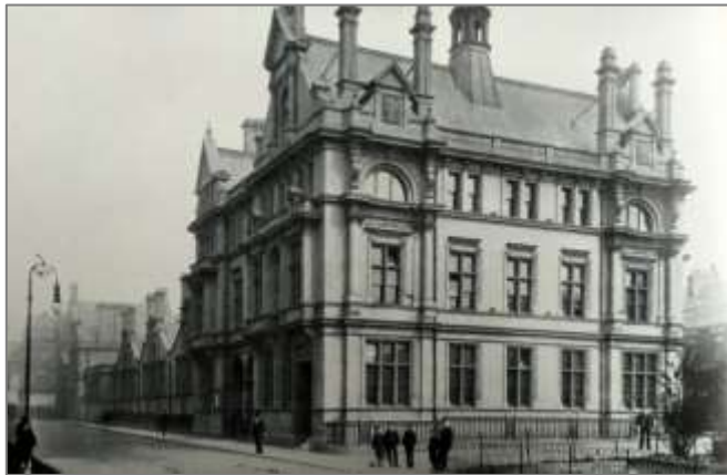
Figure 3: Vintage photo of the Post Office building.

The post office building was opened on the 1 st of August 1903 , and it housed the Post Office, the Telegraph department and the Inland Revenue office. The building still stands and is located in the West Sunnyside area of Sunderland; and today it is currently used for residential apartments. It is a protected British building.