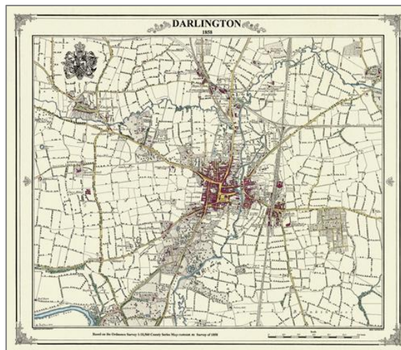
Figure 2. Map of Darlington (circa: 1858).

The post office was opened in the mid-1860s .