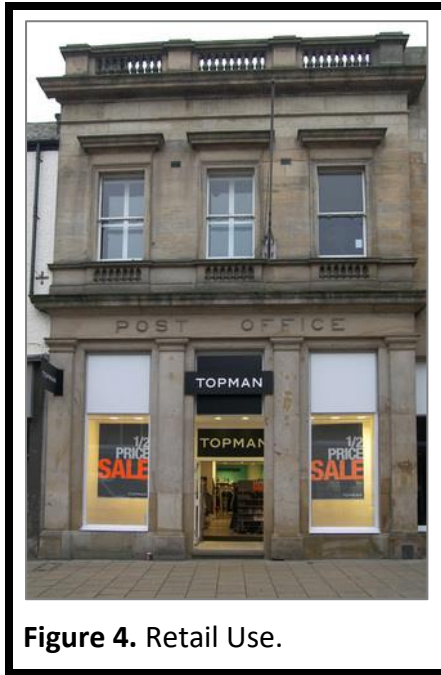
Figure 4. Retail Use.

The “ POST OFFICE ” wording is still present on the façade of the building today, as shown in the photograph below.