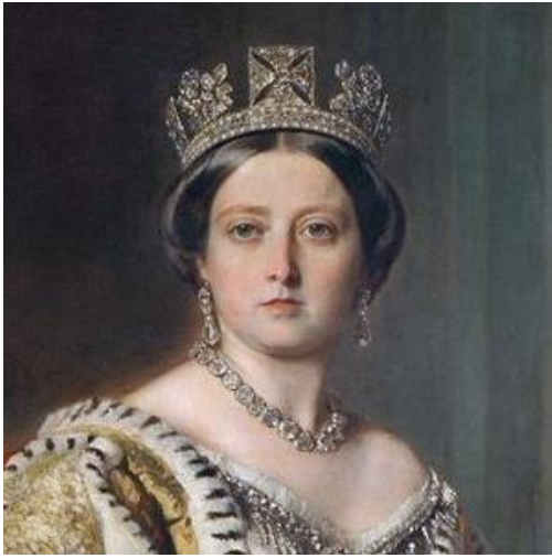
Figure 3. Queen Victoria (portrait)