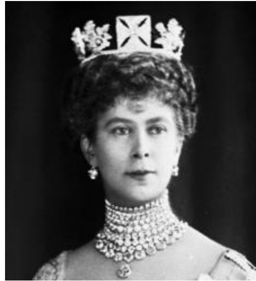
Figure 4. Queen Mary (photograph)