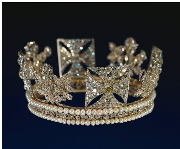
Figure 2. George IV State Diadem

This diadem is worn by monarchs or their consorts in procession to coronations and also State Openings of Parliament.