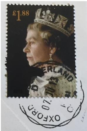
Figure 1. Queen Elizabeth II (Royal Portraits) – 1.88 GBP – issued May 30 th 2013.

This highest value stamp was based on a portrait painted by Richard Stone in 1992, and it shows the Queen wearing a special crown (or “ diadem ”) called the George IV State Diadem . This diadem, otherwise known as the Diamond Diadem , was made in 1820 for King George IV (1762 – 1830).