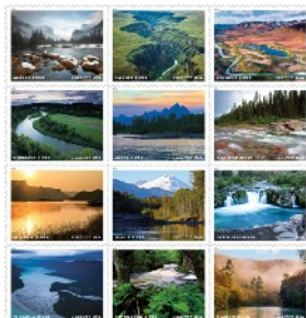
Wild and Scenic Rivers May 21