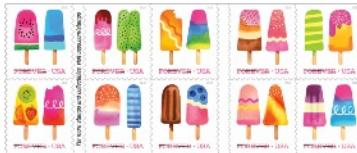
June 20 Frozen Treats