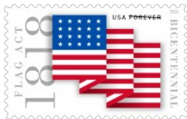
June 9 Flag Act of 1818