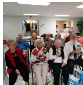
Some Door Prize Winners

The Christmas dinner of the club was enjoyed by all who attended. All had a wide selection of dishes to choose from and the activities after the meal was a good time.