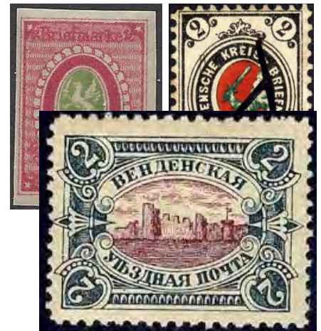
Wenden Stamps are listed as Russia-Wended #L1-L12.