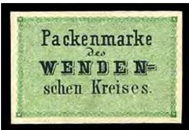
Stamp used on packages (#L3)

Instead it permitted each district to deliver mail at its discretion. The Wendensche Kreispost (Wenden Local Post) was established in 1862 to provide postal service to the relatively small town of Wenden and surrounding countryside. It was the first rural post in Russia. The Wenden postal service operated until April 23, 1903. During the period of its operation it