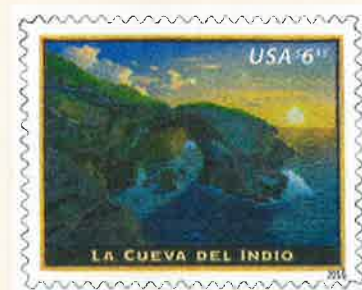
43. La Cueva del Indio stamped envelope