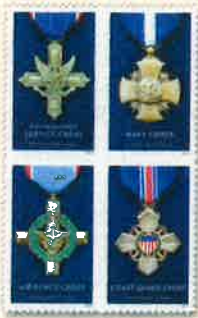
7. Service Cross Medals