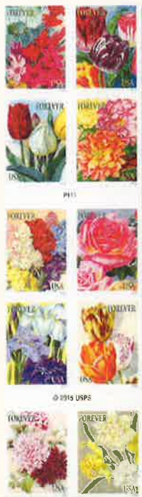
22. Botanical Art