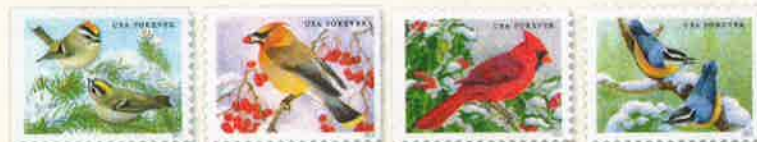
33. Songbirds in Snow