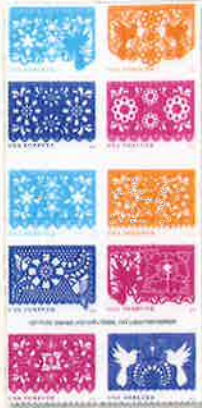
26. Colorful Celebrations