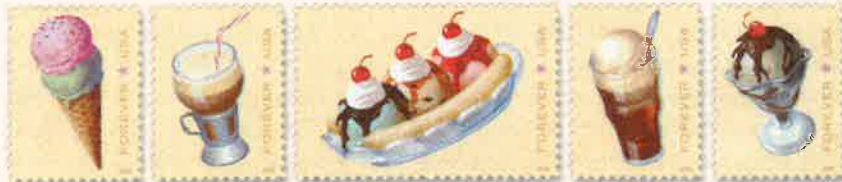
28. Soda Fountain Favorites