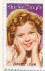
4. Shirley Temple