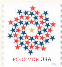
34. Patriotic Spiral