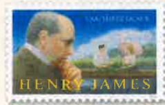
31. Henry James