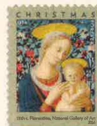
40. Florentine Madonna and Child