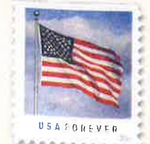
23. U.S. Flag