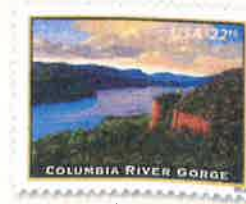
21. Columbia River Gorge