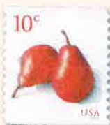
19. Red Pears