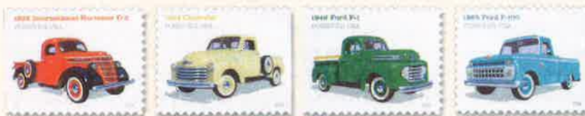
30. Pickup Trucks