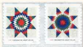
29. Star Quilts