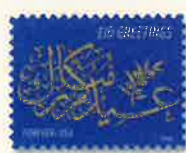
27. Eid Greetings