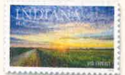
12. Indiana Statehood