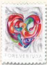
16. Quilted Paper Heart