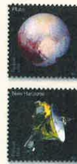
9. Pluto Explored