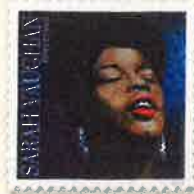
3. Sarah Vaughan