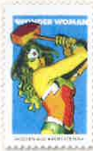
15. Wonder Woman