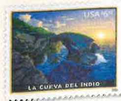
20. La Cueva del Indio