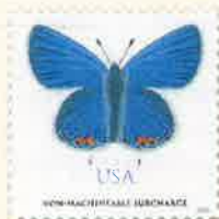
35. Eastern Tailed-Blue Butterfly