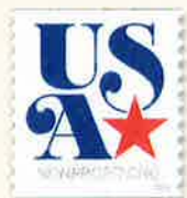
25. USA Star