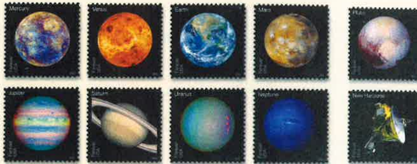
8. Views of Our Planets