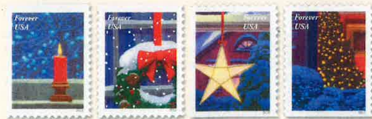
39. Holiday Window Views