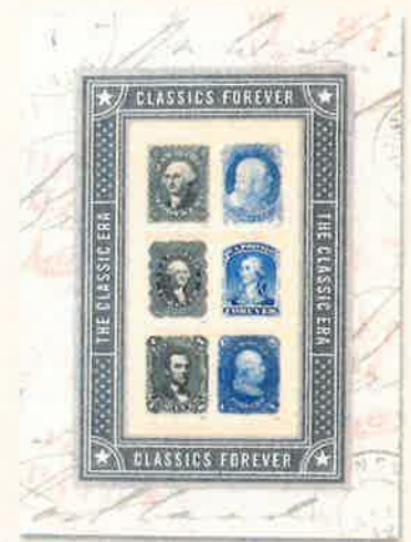
10. Classics Forever