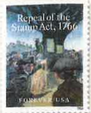
6. Repeal of the Stamp Act, 1766