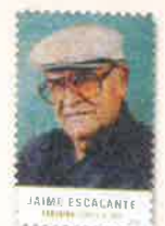
13. Jaime Escalante