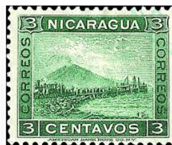
Scott No. 123