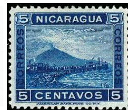
Scott No. 125

*OUR MEETING LOCATION* Student Services Building at Northeast State Community College Located near the Tri-Cities Airport *OUR INTERNET WEBSITE* www.sefsc.org/holston-stamp-club.html