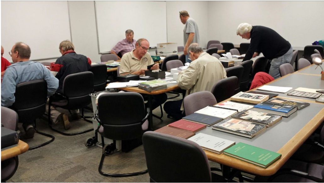
Pictures of many club members enjoying the bourse during evening of October 30th. Look carefully and you might find yourself among all of the stamps.