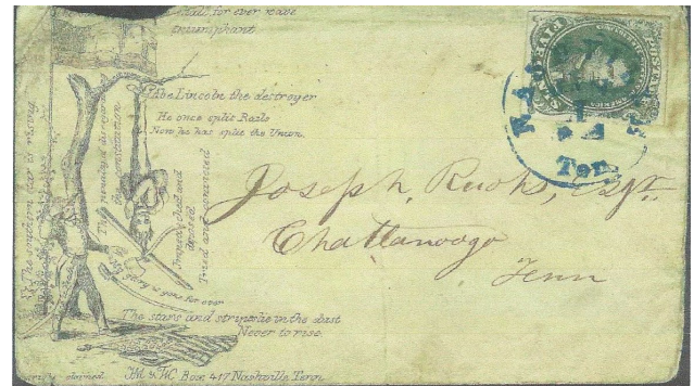
Figure 1. "Hanging Lincoln" Chattanooga Cover.

Widely recognized as one of the rarest and most distinctive of all Confederate patriotic covers is the "Hanging Lincoln", shown in Figure 1. Mailed from Nashville to Joseph Rooks (?), Chattanooga, Tennessee, this cover is one of only twelve examples recorded. (The Chattanooga cover realized an auction price of $11,500.)