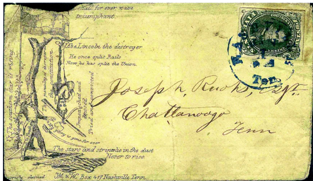
Figure 1. “Hanging Lincoln” Chattanooga Cover.

Widely recognized as one of the rarest and most distinctive of all Confederate patriotic covers is the “Hanging Lincoln”, shown in Figure 1. Mailed from Nashville to Joseph Rooks (?), Chattanooga, Tennessee, this cover is one of only twelve examples recorded. (The Chattanooga cover realized an auction price of $11,500.)