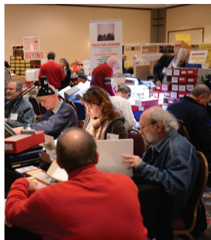
Once thought to be a place where stamp collecting was not as actively pursued as in other parts of the country, Atlanta now supports a very vigorous stamp show the aisles of which were crowded during 80% of the show’s hours!

So yes, Scott, we are offering our readers some coverage of this fine show—it deserves it and, not only that, but it is here in these pages because it can serve as an example to medium-sized stamp shows across the country that the health of the hobby is in good hands when shows like this exist!